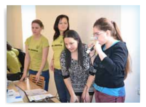
Figure 7 and 8: Measurement of risk factors for CVDs, Trnava, Slovakia

tackling health inequalities and health support. The video clip can be a part of an application to obtain structural funds to implement the Action plan in practice and to ensure sustainability of activities aimed at health support of the Trnava population. All the previous activities have been and continue to be presented at domestic and international conferences, as well as in print and electronic media.